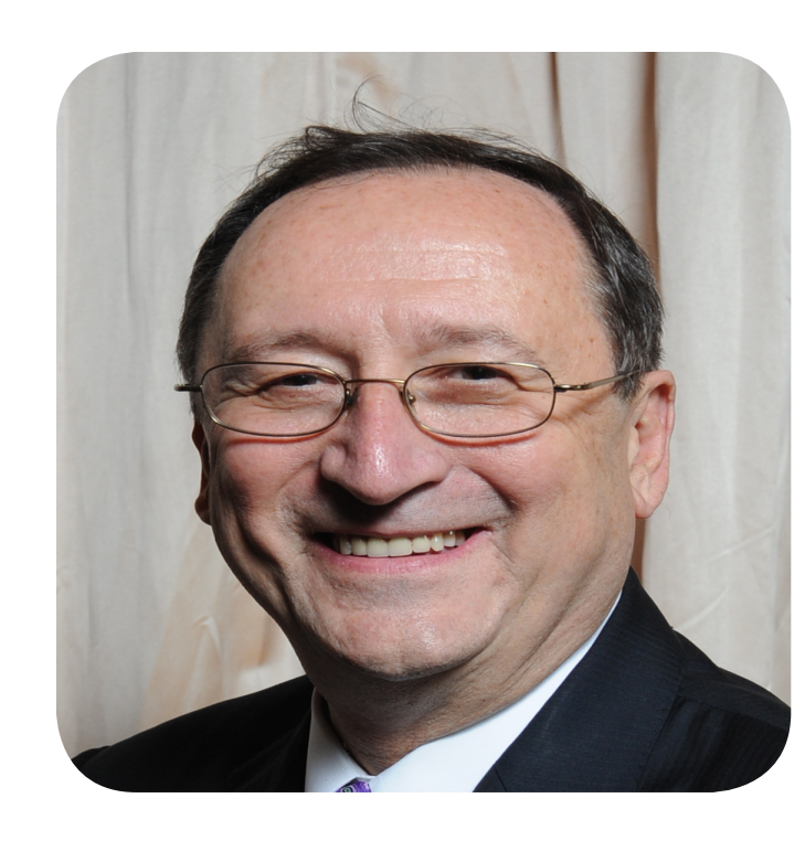
CLASS OF 1967 CHAIRMAN AND CEO OF TOWERS WATSON, AND SERVES ON THE BOARD OF DIRECTORS OF THE U.S. - CHINA BUSINESS COUNCIL, MAXIMUS AND HUDSON HIGHLAND. A FELLOW OF BOTH THE SOCIETY OF ACTUARIES AND THE CONFERENCE OF CONSULTING ACTUARIES, AND HAS SERVED AS A TRUSTEE OF THE ACTUARIAL FOUNDATION. RECEIVED THE PRESTIGIOUS MARCO POLO AWARD FROM CHINA.